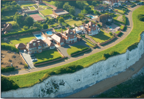
Exclusive and genteel cliff-top properties alongside Cliff Promenade, Broadstairs.