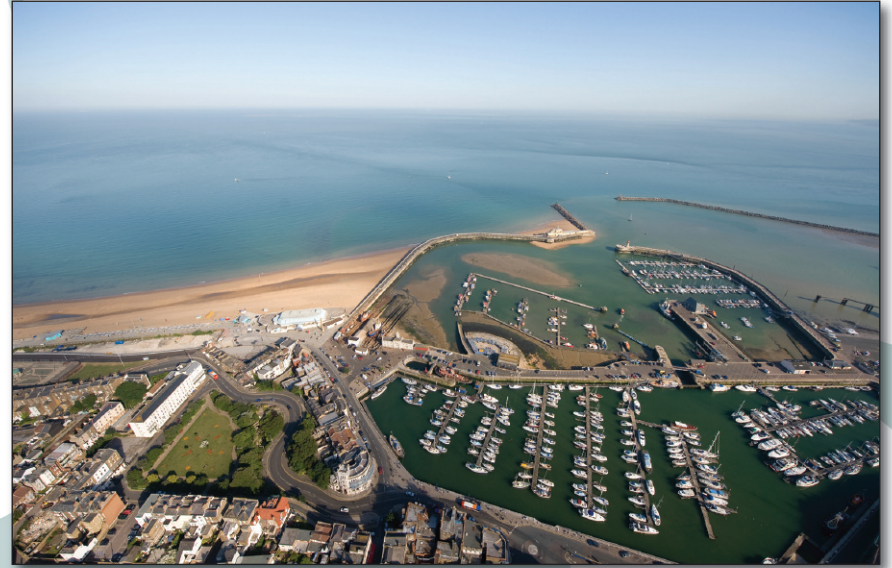
While it is the harbour that defines Ramsgate, its wide sandy beaches have appealed to holiday-makers from Victorian times onwards.