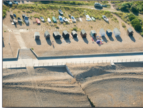
Summer holiday weather at the beach huts, Kingsdown.