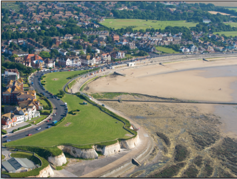
A fine view over Westgate Bay.