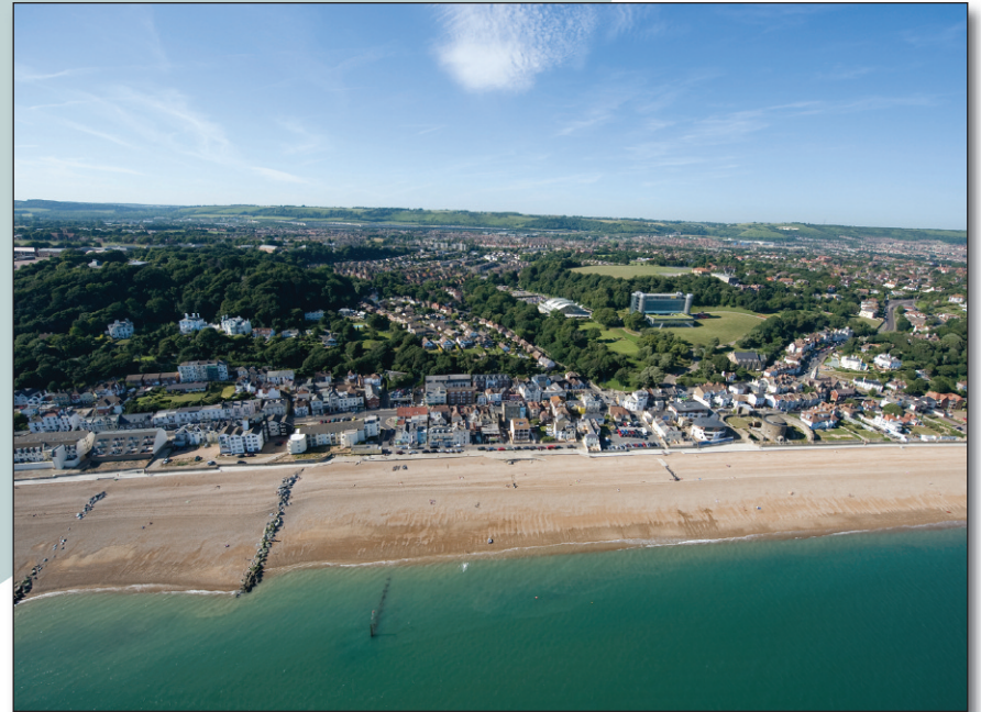
A superb panoramic view over Sandgate.