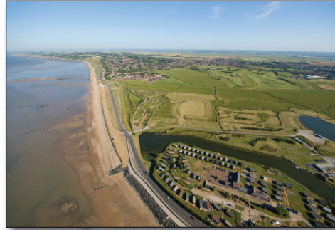
Looking south-east along the coast towards Minster.